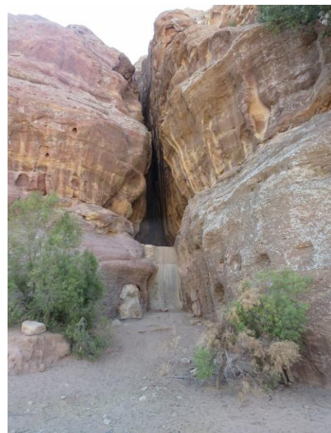
A Nabataean period dam on Wadi Ba'aja has been refurbished again and again to the present day, and is still used by the `Ammariin tribe to harvest water for livestock.