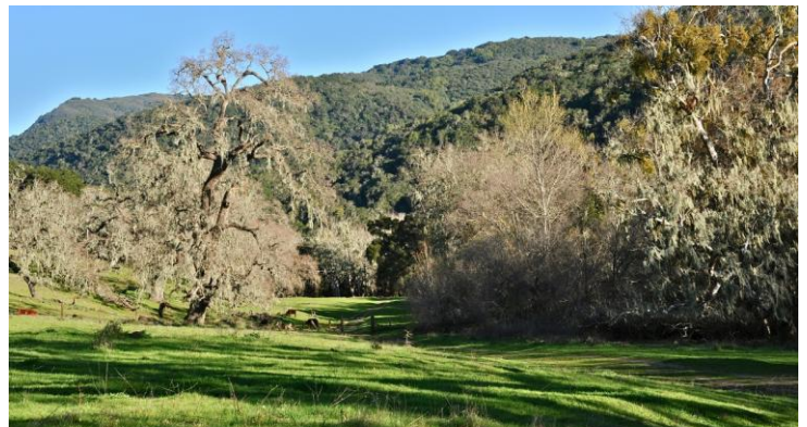
Above, Quiota Creek, Photo by John Evarts.

Bring binoculars, sun protection, lunch and water, dress in layers and wear good sturdy shoes, such as hiking boots. Trip hiking poles are recommended as some sections of the trail may be moderately steep or rocky.