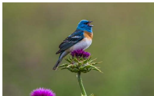
Left, Lazuli Bunting singing