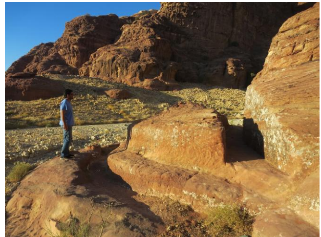
Double channels carved into the sandstone of the Ba'aja massif both harvest and control runoff onto the agricultural plain below.