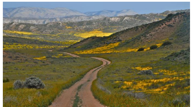
Carrizo Plains, spring

Bring lunch, lots of water, good sun protection, dress in layers for possible swings in temperature, and wear sturdy hiking shoes. We may cross slippery or rocky areas, so please bring hiking poles if you normally use them. Our hikes probably will not be long, but the terrain may be uneven. There are some facilities in the Monument, but they are widely spaced. Soda Lake Road and the other roads in Carrizo Plain are unimproved dirt; please drive appropriate vehicles. All-wheel drive or 4WD vehicles are encouraged.