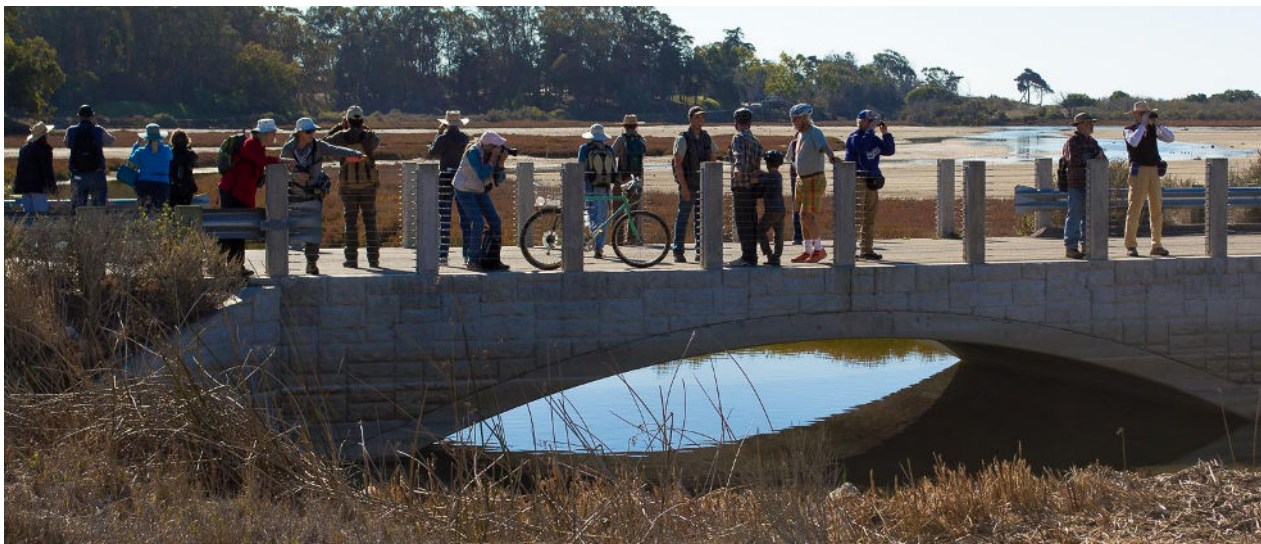
Light and water at Devereux Slough illuminate many birds for SYVNHS members.